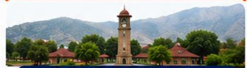
KASHMIR UNIVERSITY (JAMMU & KASHMIR)