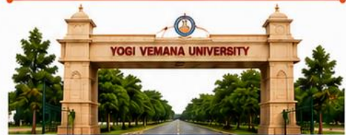
YOGI VEMANA UNIVERSITY (ANDHRA PRADESH)