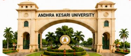
ANDHRA KESARI UNIVERSITY (ANDHRA PRADESH)