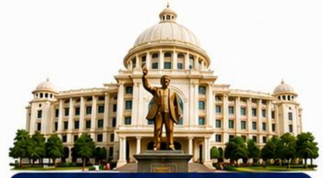
BABA SAHEB AMBEDKAR EDUCATIONAL UNIVERSITY (WEST BENGAL)